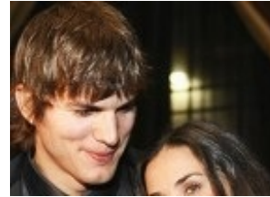
It's Official: Demi Moore to Divorce Ashton Kutcher