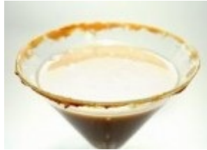
Peanut Butter Lover's Month