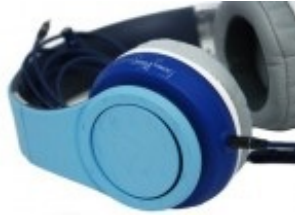
Fanny Wang Custom Colors Headphones