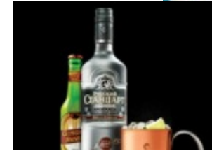
Trendy Beer Cocktails