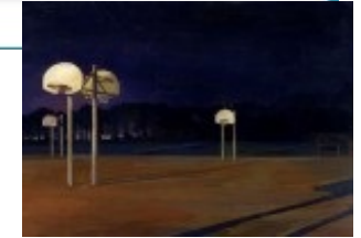
Welcome to Nuclear Winter, NBA Fans

We'll Find a Book Publisher For You in 3 Easy Steps.