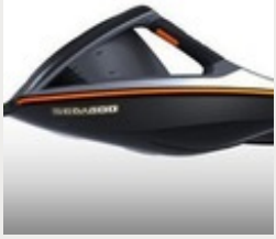
10 Coolest Inventions of the Year