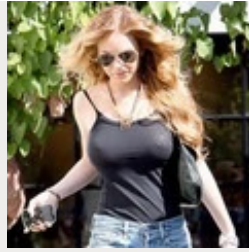
Only The Blind Won't Notice This! It's Impossible No To Spot That!